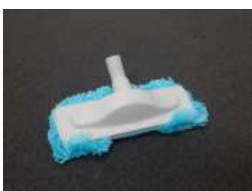
MICROFIBRE DUST MOP