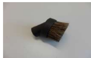
ROUND DUST BRUSH