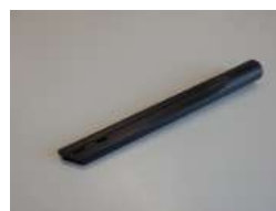
MEDIUM CREVICE TOOL