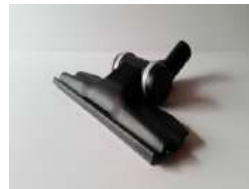
LOW PROFILE FLOOR TOOL