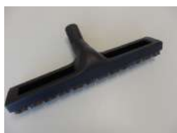
HARD FLOOR BRUSH