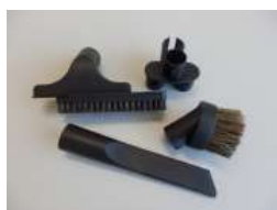
4 PCE ATTACHMENT SET