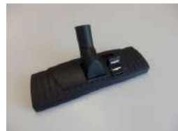
STANDARD FLOOR TOOL