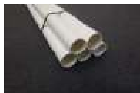
VACUUM PIPE 50MM