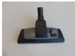
DE LUXE FLOOR TOOL