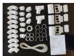
DIY INSTALL KIT