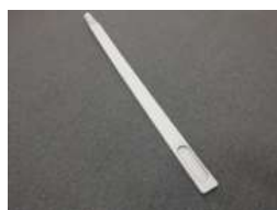
LONG CREVICE TOOL